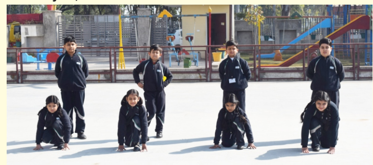
February 02, 2018: 200 m Race - Grade II & III: