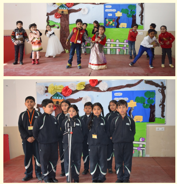
'Foundation is the key to longevity.'

February 09, 2018: Special Assembly on Foundation Day :