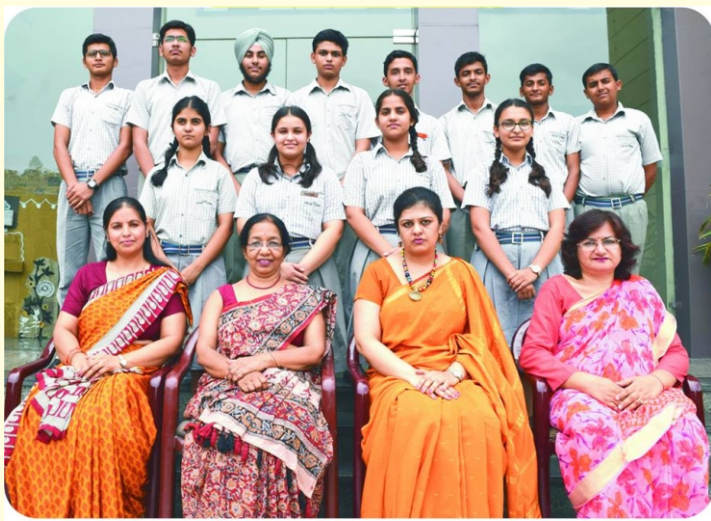
Grade IX (Batch 16-17)