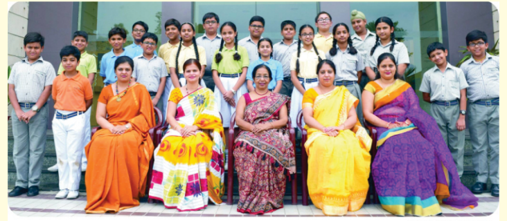
Grade V (Batch 16-17)