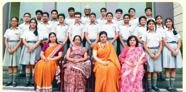
Grade VIII (Batch 16-17)