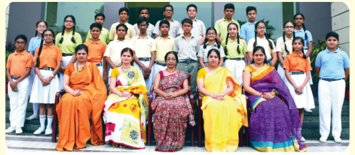
Grade VI (Batch 16-17)