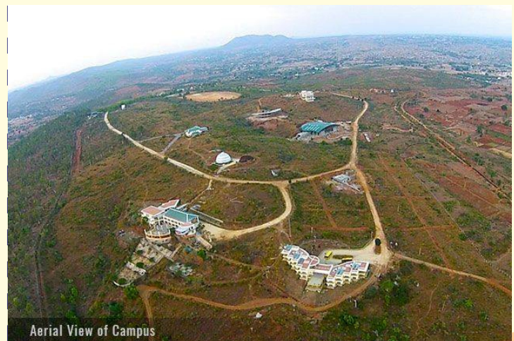
Aerial View of Campus

On the second day of their visit to the Deenabandhu Trust, Bangalore, the teachers were trained to design T.L.Ms (Teaching Learning Materials) at the Deenabandhu Teachers Resource Centre. The most thrilling event of the day was the release of a toy rocket by our teachers. Not only the students but the teachers were also excited to see the successful working of their self made rocket.