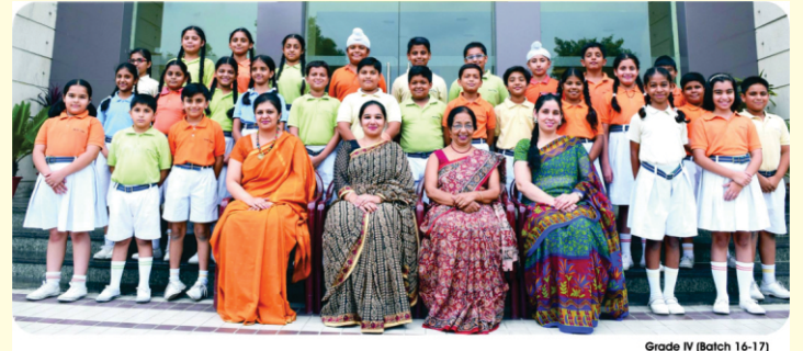
Grade IV (Batch 16-17)