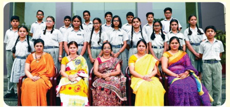
Grade VII (Batch 16-17)