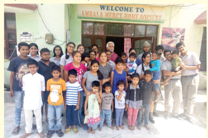
May 24, 2018: Visit to Mercy Home, Ambala - Grade IX and X:

Under the CBSE scheme of 'Sewa', students of Grade IX - X visited the 'Ambala Mercy Home' situated on the outskirts of Panjokhra, Ambala. Students spent around two hours with the children playing and sharing stories with them. A blend of euphoria and gratitude was writ large on their faces. Our students left the place with wet eyes full of thankfulness to the Almighty.