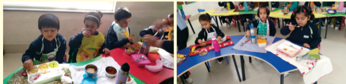
Table manners competition for LKG class was conducted. The event was planned to develop good table manners skills among the students. The students were instructed to follow certain rules of table manners. All present students joined this activity with a lot of eagerness and sincerity. Participants were evaluated on the way they followed the instruction. The winners were: