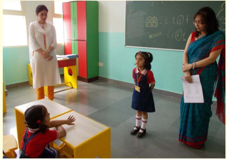
May 12, 2017: Speech Competition - LKG :

A speech competition was held to mark the "Mother's Day celebrations". The kids from LKG spoke in a beautiful way about how a mother's role is important in one's life. The words that they spoke came from their heart and the speeches expressed deep love for their mothers. The winners were: