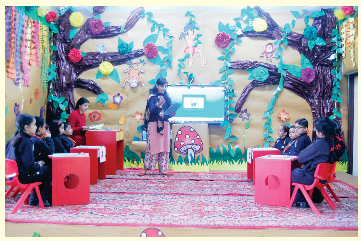
'The important thing is to never stop questioning'-Albert Einstein

On 27th November, our school conducted an intra-class Science Quiz Competition for the students of Grade III to inculcate fun and active participation among the students. The quiz entailed seven rounds. Each round comprised of different questions extracted from different topics of science. The participants were able to learn the value of patience, determination, hard-work and self-discipline through this quiz. Overall, it was a knowledgeable experience and exposure for the students after competing in the quiz.