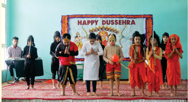
There is no denying that there is evil in this world but the light will always conquer the darkness.

Dussehra, the festival to celebrate the victory of good over evil, was celebrated at Mind Tree School with a lot of religious zeal and fervor. The primary objective of the celebration was to make the students aware of the oft repeated message i.e the triumph of virtue over the