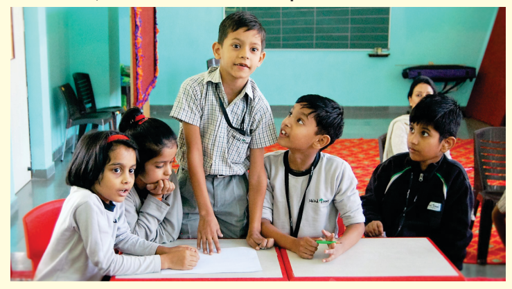
"Knowledge is of no value unless you put it into practice"

Keeping this thought in mind, we conducted an intra class science Quiz for Grade II students. The Quiz entailed seven rounds. Various questions based on different aspects of science were asked. The students were at their literary best while answering the questions in the different rounds of the quiz. It provided an opportunity for the participants to explore the world of science. It was a wonderful experience for the students as well as the teachers because knowledge is the only kind of wealth that multiplies when you give it away. The winners were:-