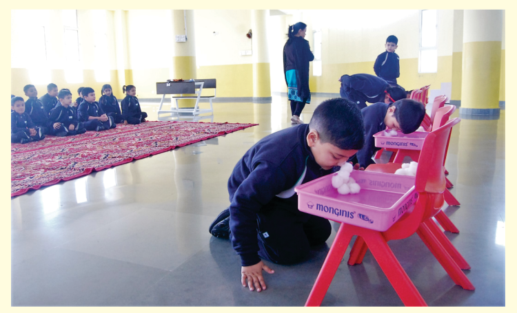
Cotton Ball Race is not only a fun Race but it also increases fine motor skills. It is a great way to teach patience among the students.

November 16, 2019: Cotton Ball Race - Grade I: