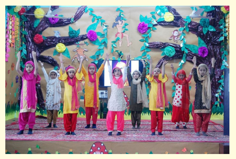
"Let no man in the world live in delusion. Without Guru no one can cross over to the other shore."