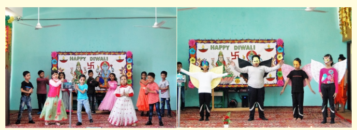
"Diya's are like hearts of people around you. Light them with your smile, laughter and whole lot of love"

Diwali is the perfect occasion to celebrate victory over defeat, light over darkness, awareness over ignorance, an occasion to celebrate life. To mark this festival, a special assembly was organised at MTS Nahan. Grade I gave a dance performance. Students of G-II and III performed a skit to show how the celebration of Diwali changed with the passage of time. Students also recited poems and gave speeches on the occasion of Diwali. Principal Ma'am gave a heartfelt speech and special assembly ended with the National Anthem.