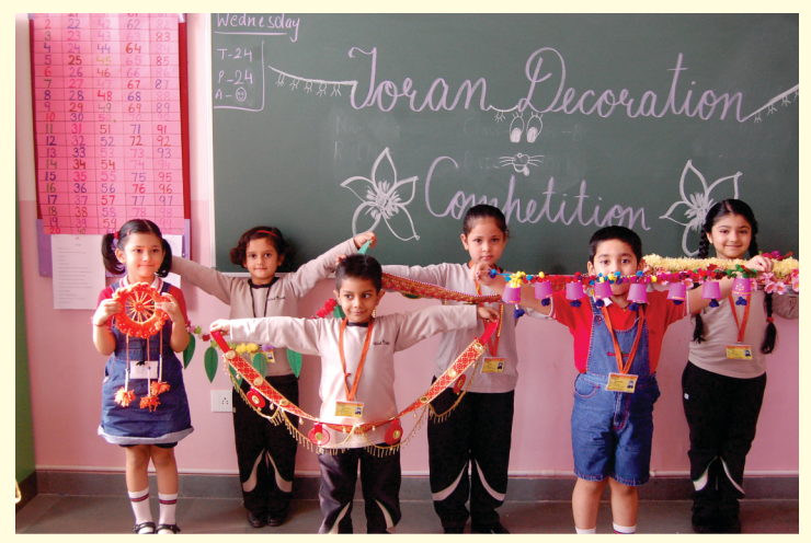
October 16, 2019: Toran Decoration Competition-UKG:

With the emotion of festive season in the air, the students of UKG participated in 'Toran Decoration Competition'. They splurged their creativity by decorating the base beautifully. Children also learnt the significance of Diwali. Participants who bagged positions were: