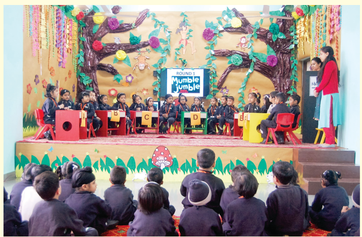
November 15, 2019: Quiz Competition - UKG:

An intersection 'Quiz Competition' was organised in UKG to emphasize on the improvement of the intellect and general knowledge of the students. Six teams participated in it, comprising four students each. The students displayed ecstatic spirit and enjoyed the quiz to the fullest. Teams who bagged the position: