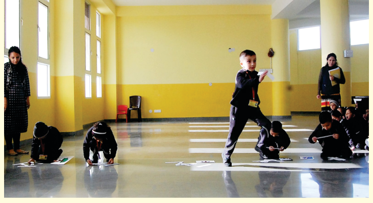
December 04, 2019: Look Read & Run Race -UKG:

"Look, Read & Run Race" was organised in UKG. It was an intra class competition in which children were told to run to a given point, pick up the flash cards & recognize the pictures on it. In the next part, they were told to find the sentence defining the picture they saw and submit them on the final point.