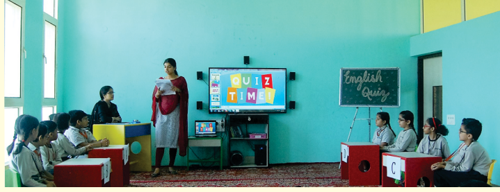
October 11, 2019: English Grammar Quiz Competition-Grade III:

A philoshpher once said, 'Half of good philosophy is good grammar.