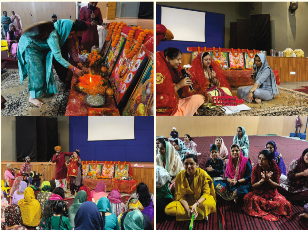
"Every morning is a fresh beginning; every prayer is a step toward purpose."

The new academic session at Mind Tree School began on a serene and auspicious note with a soulful Kirtan. The soothing hymns created an atmosphere of peace, positivity, and gratitude, setting the perfect tone for a meaningful year ahead. The gathering reflected harmony and spiritual grounding, inspiring everyone to begin the journey of learning with hope, focus and renewed energy.