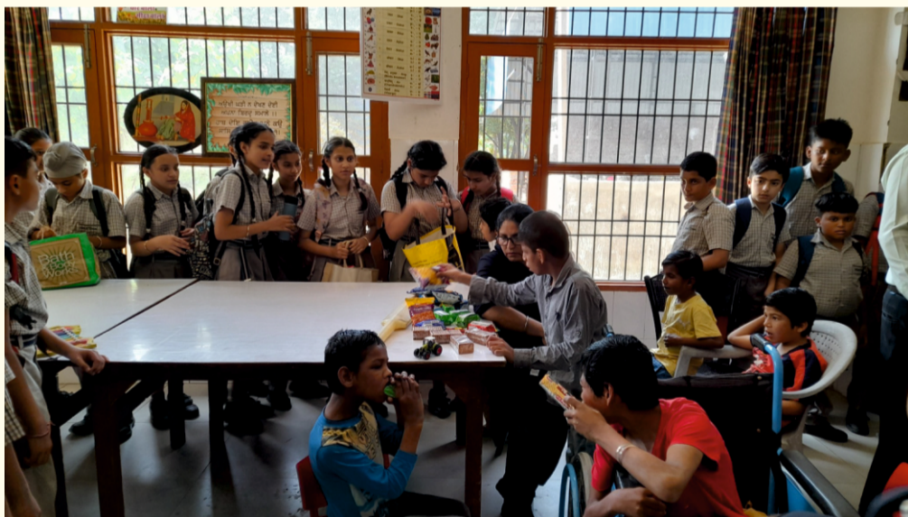
April 22, 2026: Visit to Old Age Home – Grade – VIII: April 23, 2026: Visit to Old Age Home – Grade – VII:

The students of Gr-III-IV visited the ISKCON Temple, gaining a serene and enriching spiritual experience. The visit offered them an opportunity to explore values of devotion, discipline, and inner peace, making it a truly enlightening and memorable learning experience.