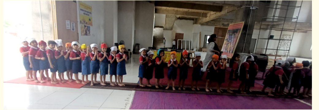
May 8, 2026: Visit to Worship Places – Kindergarten:

The students of Grade VII & VIII at Mind Tree School visited Prabh Aasra, engaging in a meaningful act of compassion and social responsibility. By contributing essential items and interacting with residents, they gained valuable lessons in empathy, kindness, and gratitude, making the experience truly enriching and transformative.