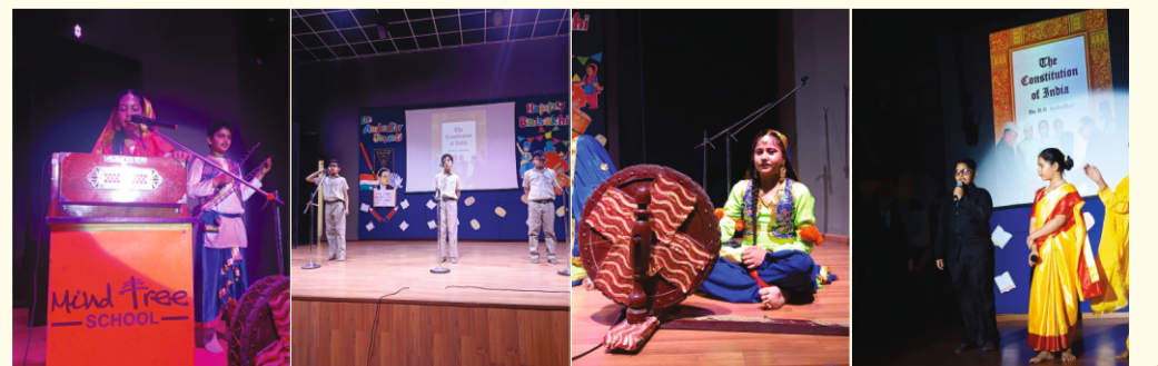
April 11, 2026: Baisakhi & Dr. Ambedkar Jayanti Special Assembly – Grade – VI: