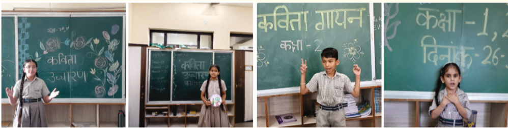
“When we recite poetry, we recite culture, emotion, and truth.”