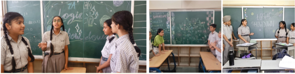
“When ideas clash, knowledge grows.”