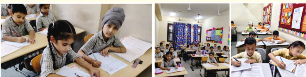
“Every stroke of calligraphy carries a rhythm of thought.”