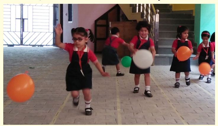
"Pat the Balloon Race" was conducted for the Nursery children. They participated with zeal and enthusiasm. The tiny tots who bagged the positions were:

October 13, 2017: Pat the Balloon Race - Nursery: