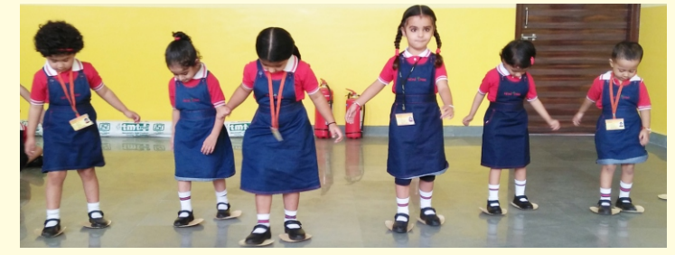
August 11, 2017: Paper Plate Skating Race - Nursery:

"Winning is not everything, but making the effort is". For a long time, sports have been viewed as a way to stay healthy and in shape, but their importance goes much further. As a matter of fact, sports teach life lessons like discipline, responsibility, self-confidence, concentration, enhanced memory, stimulated creativity and better developed problem solving skills. We, at Mind Tree, take care of all these things and in this context we keep on conducting sports competitions. Children who bagged positions were: