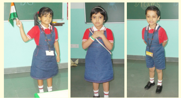
A speech competition was organized in UKG standard on 2nd of August, 2017. All the students expressed their views on the topic 'India of My Dreams'. They revealed their dream of a developed India where everyone should get free education and free medical services. They were excited to participate in competition and enjoyed a lot. The students who bagged the positions were :