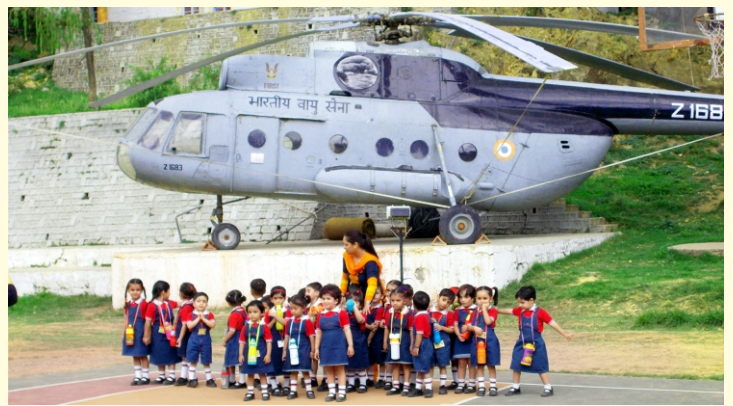
"The more you read the more things you will know. The more you learn the more places you'll go".

Field trips give students educational experiences away from the regular school environment and give a welcome break in routine. Field trips also provide alternative educational opportunities for children. In this context, we took our Nursery Toddlers for a Field Trip to Bus Stand and Army Ground. It was an amazing experience for the tiny tots as they got the opportunity to see real life application of the lessons that they are learning in school. They are more likely to understand and appreciate the importance and relevance of what they are learning.