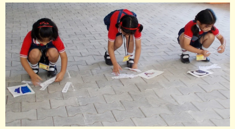
September 20, 2017: Look, Read and Run Race - UKG:

Running is always a fun for the tiny tots. 'Look, Read and Run Race' is also one of its kind. Children of UKG standard participated in this competition. Children had to find a specific sentence from a group of sentences related to the picture they already had in their hands. They would read the sentence and then run back to the final point. Children enjoyed this competition a lot. Students who bagged positions were: