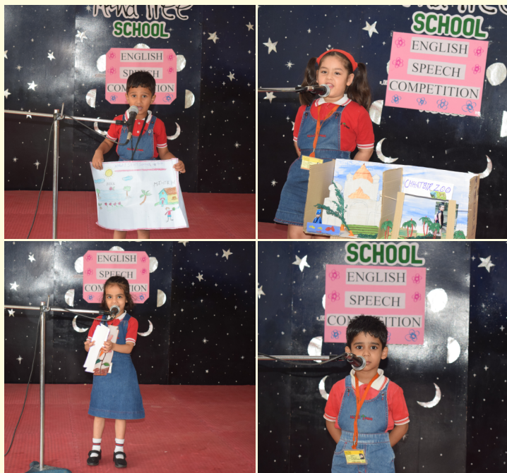
July 27, 2019: English Speech Competition (Patriotic Hero) UKG :