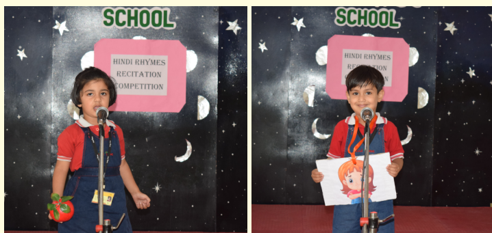
July 26, 2019: Hindi Recitation Competition – Nursery :

"Poetry is the rhythmical creation of beauty in words."