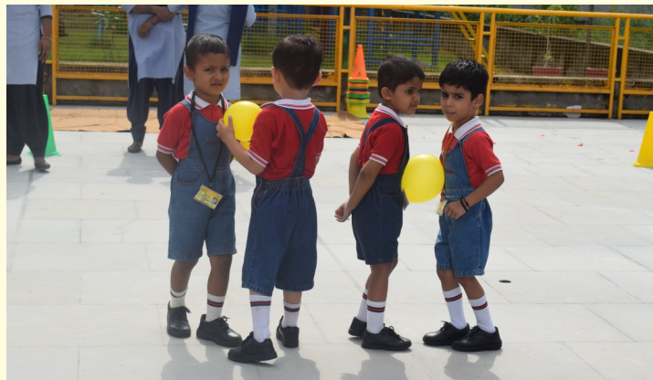
August 01, 2019: Couple Balloon Race – LKG :