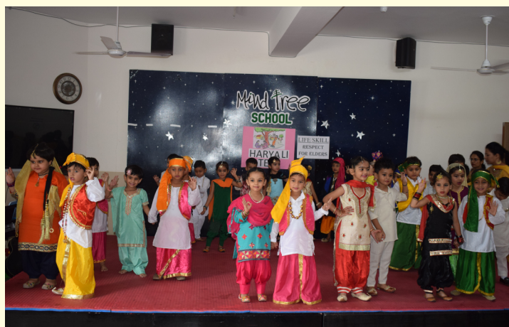
August 2, 2019: Special Assembly on Haryali Teej - LKG :

The word 'Haryali' symbolises greenery and represents the monsoon season when downpour brightens up the surroundings. The tiny tots of LKG came dressed up in their traditional outfits and presented a ramp walk. These young cultural ambassadors performed 'gidda', that was the highlight of the show. It was a delightful experience to witness the festivity which made the whole environment lively and colourful.