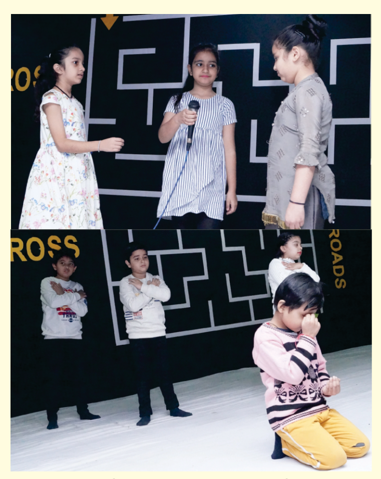
December 13, 2019: Special Assembly on National Energy Conservation Day:

Human Rights have gained immense importance because of evil forces of terrorism, child trafficking, violence etc. rampant everywhere. Human Rights Day was observed wherein students of Grade I-E gave an informative speech and also performed an emotive dance. Students of Grade II-E enacted a play to highlight the need for a better and peaceful world.