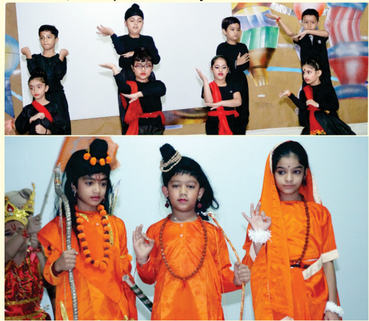
October 07, 2019: Special Assembly on Dussehra:

Dussehra was celebrated with a lot of fervour and ardour. A spectacular dance by the students of Grade I-D and a one act play by the students of Grade II-D was presented to the audience. The children enjoyed themselves a lot.