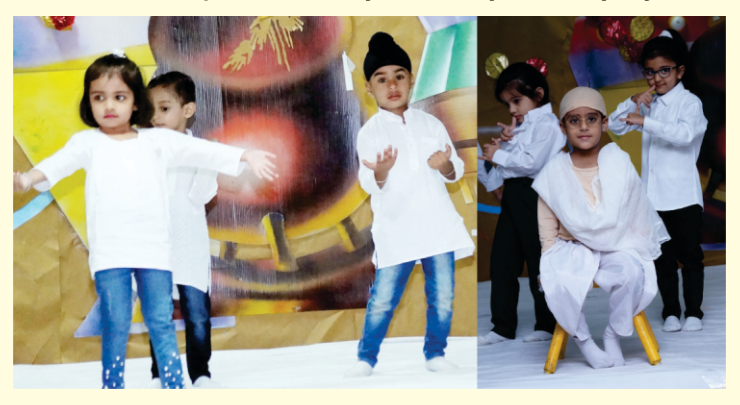
"You must be the change you wish to see in the world."

October 1, 2019: Special Assembly on Gandhiji & Shastriji Jayanti :