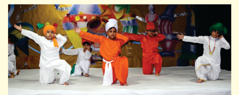
November 11, 2019: Special Assembly on Guru Nanak Jayanti:

Haryana is a land of rustic beauty, greenery and is the cradle of Indus Valley Civilization. Haryana Day was celebrated to commemorate the creation of this lively state on 1st November 1966. Students of Grade I-C and II-E presented spirited dance performances to mark the day.