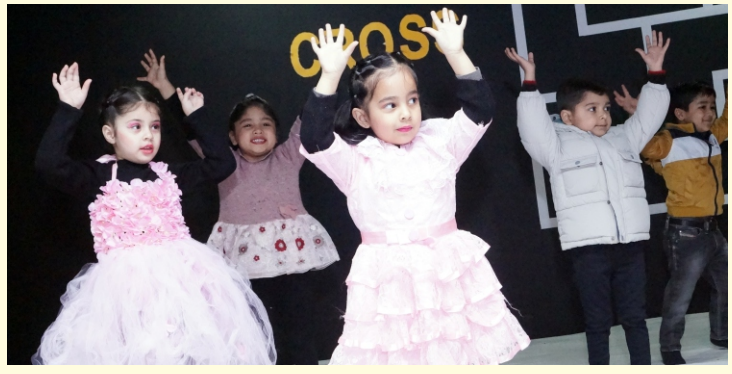
A special assembly on Human Rights Day was organized wherein the students were enlightened about the significance of this day.