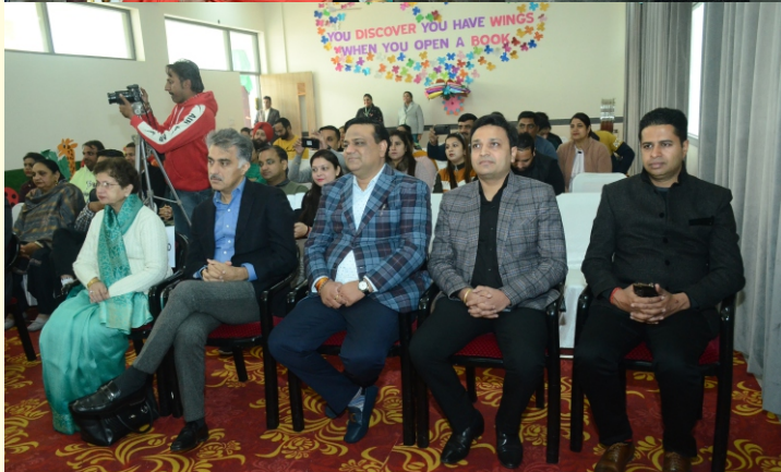
December 03, 2022: Blooming Dales - Nursery A & B:

Blooming Dales was celebrated on 3rd December 2022. It showcased daily classroom activities. Nursery kids performed confidently in front of their parents demonstrating their comprehension and spoken skills.