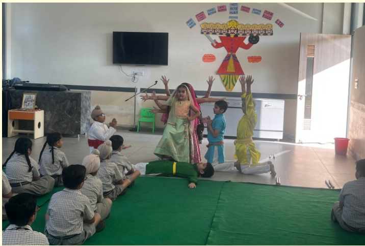
October 7, 2022: Valmiki Jayanti - Grade 1 :