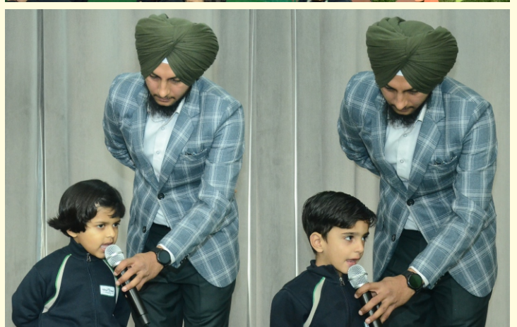
Blooming Dales - LKGA & B:

It was a multi-sensorial program which highlighted the spirit of learning, reading, comprehension and physical aspect. Children showcased their skills during this program. Parents joined us in the celebration of major milestones of our student's academia.