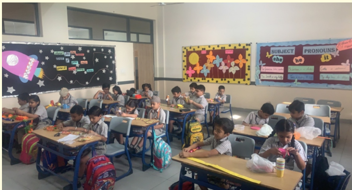
October 17, 2022: Toran Making Competition - Grade 1 :

Decorating the home during festivals is a very important part of Indian traditions. To emphasize this, 'Toran Making Competition' was conducted for the students of Grade I. The enthusiasm showed by the students was great. This competition helped the students to learn, how to decorate their homes and how can they help their parents during the festivals. Winners of the competition were: