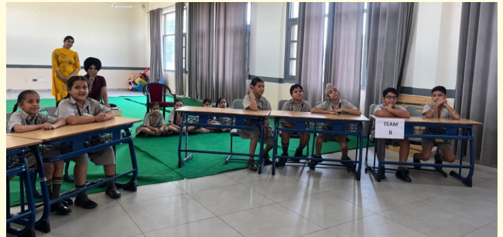
October 17, 2022: Science Quiz Competition - Grade 2 :