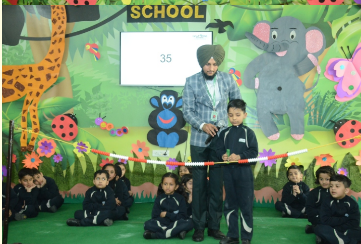
Glimpses - 100 Days Celebration: