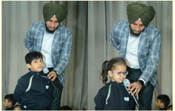
GROUP - B

Blooming Dales was celebrated on 3rd December 2022. It showcased daily classroom activities. Nursery kids performed confidently in front of their parents demonstrating their comprehension and spoken skills.