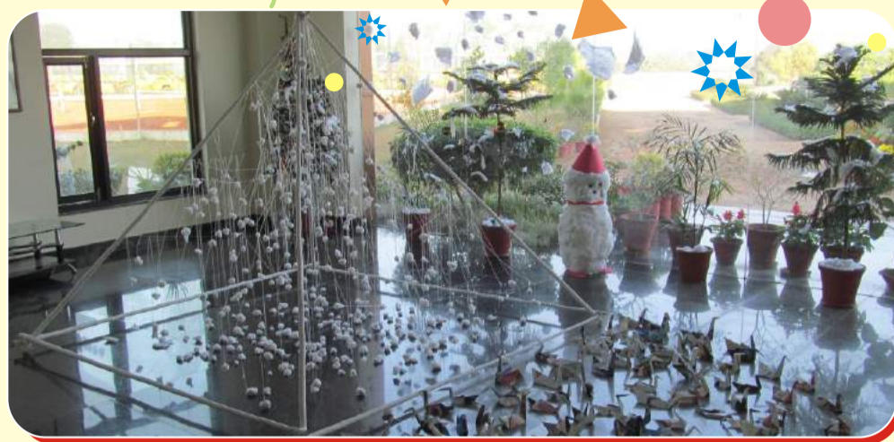
Art Installation ..... "Snowflakes"