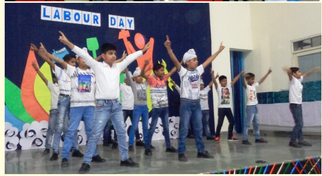
\hbox{\it ``Without labour nothing prospers.''-Sophocles}

To celebrate the compassionate efforts of the school work force, Mind Tree organized a special assembly on the occasion of Labour Day. The day was celebrated with great ardour as the students gave special reception to their favourite 'uncles' and 'aunties'. An exceptional show was put up for all the worthy workers. Rhythmical songs and poems highlighting the importance of hard work and dedicated to the workers were rendered by the students. The pinnacle of the assembly that made everyone grin with glee was a short skit that presented a day at school without the workers. The struggles and troubles resulted in a comedic yet learning experience for the children. The entertainment continued with a special dance number that was specially curated for the support staff. The assembly culminated with the distribution of gifts and a significant address by the School Principal. She thanked the workers for their selfless efforts and their contribution towards the prosperity and opulence of the school.