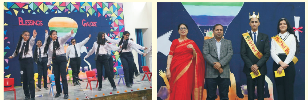
March 04, 2023: A Date With Disney - Kindergarten Annual Day Programme: