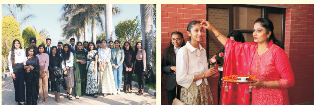
February 04, 2023: Blessings Galore - Grade X:

Ceremony to shower blessings and best wishes on the outgoing batch of Gr-X was organized by the students of Gr-IX on February 4. The seniors made a grand appearance in their best avatars and looked absolutely stunning. They were received at the entrance by their teachers who welcomed them with tilak and flowers. The juniors, on their part, had left no stone unturned to make the day a memorable one for them. Dance on a foot tapping number, stand-up comedy, skit, rap and a couple of delightful games were laid out to entertain the students. The school principal handed over mementoes and scrolls to the students