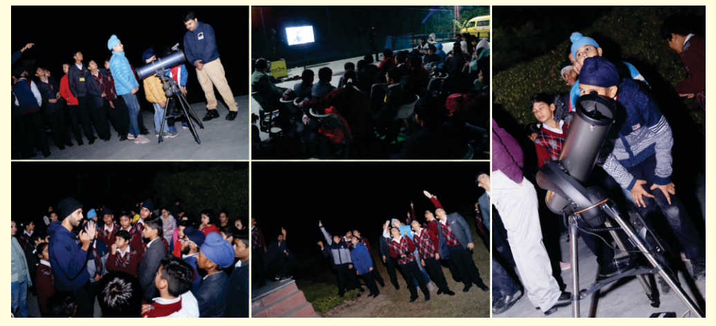
'The Stars are the street lights of eternity.'

The twinkling stars make the children wonder about what they are right from a very young age. This curiousity and fascination with stars gradually transforms into a spiral of knowledge. To intensify the students' curiosity regarding the scientific cognition behind the formation of stars and galaxies, a panel of astro experts from Pune orchestrated the star gazing event and presented the students with a bag full of interesting facts and ideas. The event featured a sky show and a number of activities which were done with the help of telescopes. Students got a chance to view planets like Jupiter, Saturn and deep sky objects like the Andromeda Galaxy at the event. Students thoroughly enjoyed the event as they engaged themselves in discovering satellites in the night sky.