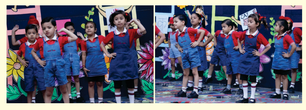
"Teaching children is an accomplishment; getting children excited about learning is an achievement."

Mind Tree School observed its annual 100 Days show for the kindergarten wing. The programme showcased the knowledge gained by our little Mindtreeans and the wholesome development of the tiny tots who completed their hundred days of learning in school. The achievements focused on the depth of understanding of the tiny Mindtreeans who presented the show with elan and thoroughly enjoyed displaying their talents. Dressed with smiles and starry eyes, the children presented themselves in a flawless manner. This cauldron of talent reflected upon various skills like reading, writing, basic arithmetic functions and comprehensive abilities of the children. The frequent poem recital sessions added a joyful flavor to this brewing cauldron as the dancing flowers displayed an amalgamation of audio and visual wonders which soothingly resonated throughout the surroundings.