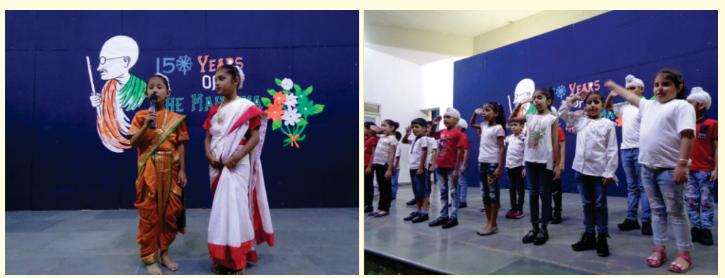
"In a gentle way, you can shake the world." - Mahatma Gandhi

October 01, 2019: Special Assembly on Gandhi Jayanti: