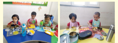
Table manners competition was held for the students of nursery. The children were evaluated on their table manners like use of cutlery, tablemat, apron, bite-size and eating with closed mouth. The winners were: