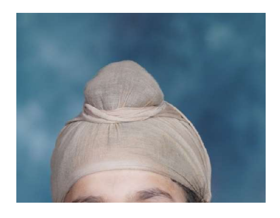
Patka: Mehndi Green Colour (for Sikh Boys)