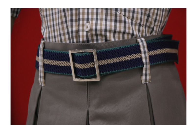
School Belt: Blue. School Belt Colour Code: 837