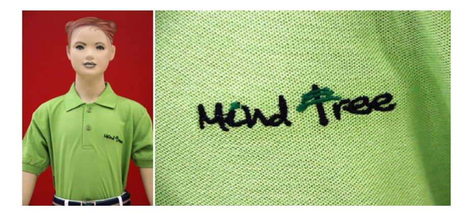
Shirt (Boys and Girls): House T-Shirt