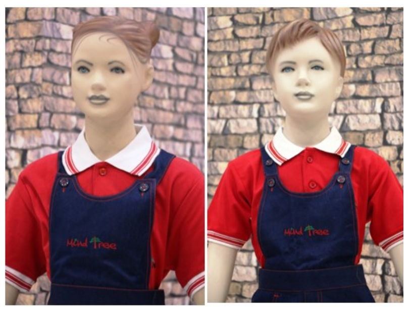
School T-Shirt: Half Sleeves Red Colour T-Shirt. T-Shirt Code: RED-04462 Trouser/Skirt Code: Dark Blue-02174