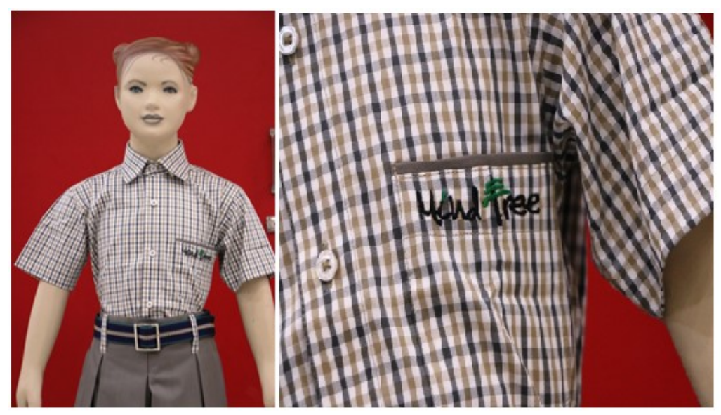
Shirt: Half Sleeves Check Shirt.