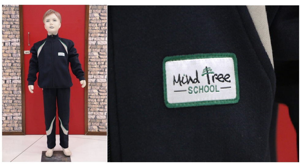
Track Suits: Navy Blue (for Girls and Boys)

Patka: White (For Sikh Boys)Shoes: White Canvas Shoes