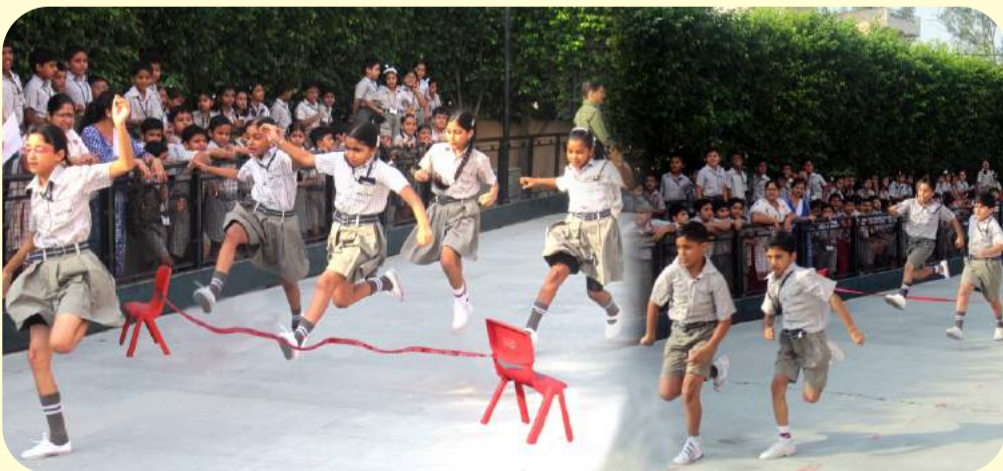
September 7, 2013: Hurdle Race - Grade II & III:

If one has to become successful, it is imperative that he works towards removing all the hurdles and obstacles coming in his way. This quote from the Sam Veda was the foundation of Hurdle Race organised for the students of Grade II and III where the students sprinted with full energy and concentration displaying complete sporting excellence. The winning racers were: