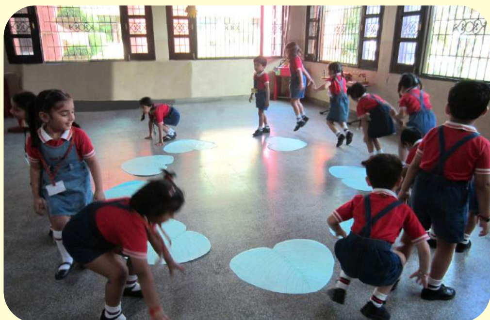
October 17, 2013: Musical Froggies Activity- LKG:

This activity was aimed at enhancing gross motor skills. Our cheerful 'froggies' came out hopping from the classrooms to the activity room in this activity.