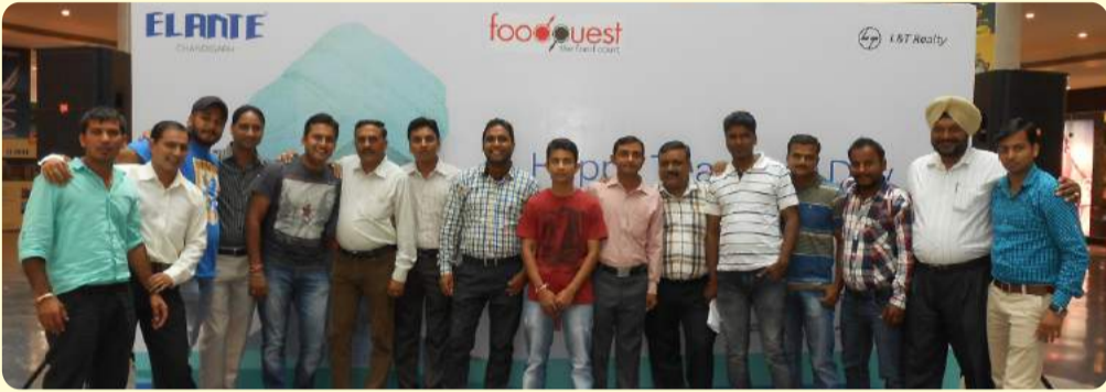
September 6, 2013: Grandparents' Day Celebration: