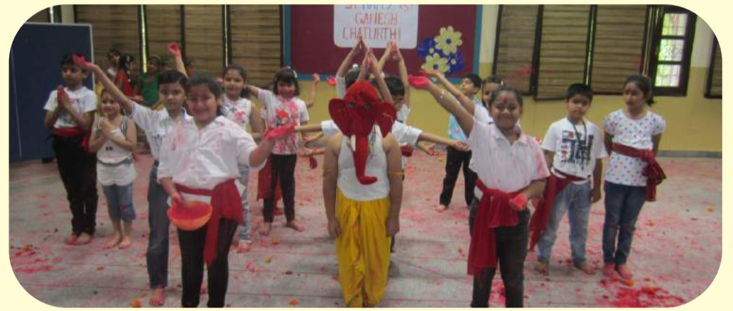
September 9, 2013: गणपती बाप्पा मोरया!!!