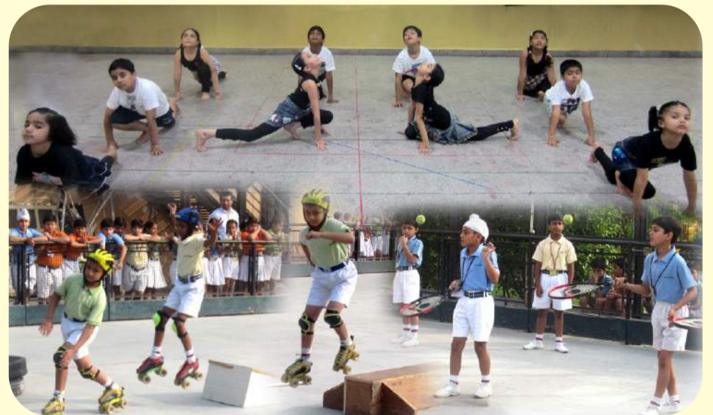
September 10, 2013: Yoga and Sports Demos:

Budding sports persons of Grade II and III left everyone with their jaws wide open as they presented extreme tricks on roller skates, showed use of flexibility and agility in Yoga and perfect coordination in Mini Tennis as demos for these sports activities were presented before the whole school. Our Principal Ms. Ohri congratulated the sports staff for their hardwork and dedication in training these little wonders of Mind Tree. It was a proud moment for us!!!