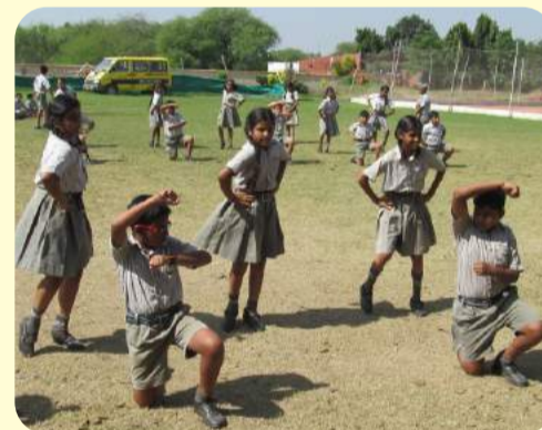
"Great Minds at Work"

October 1 to 29th, 2013: Annual Day Preparations and the Exciting Fervour Around: