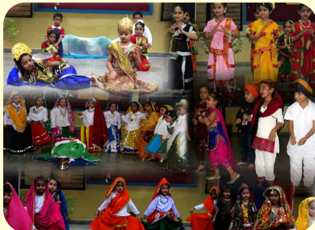
October 28, 2013: Haryana Day and Diwali Celebrations: