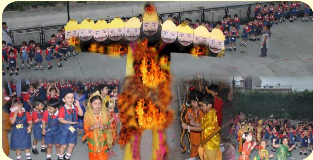
October 17, 2013: Special Assembly on Valmiki Jayanti and Bakr-Id: